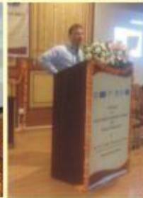
Dr. Ziad Kazzi

The workshop also comprised of a display of various emergency disaster management equipment showcased by a team of NDRF (National Disaster Response Force). They also conducted a practical demonstration of the protocol for disaster management, which was well appreciated by all delegates.