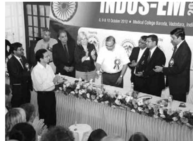
The Chief Guest Inaugurating the Conference