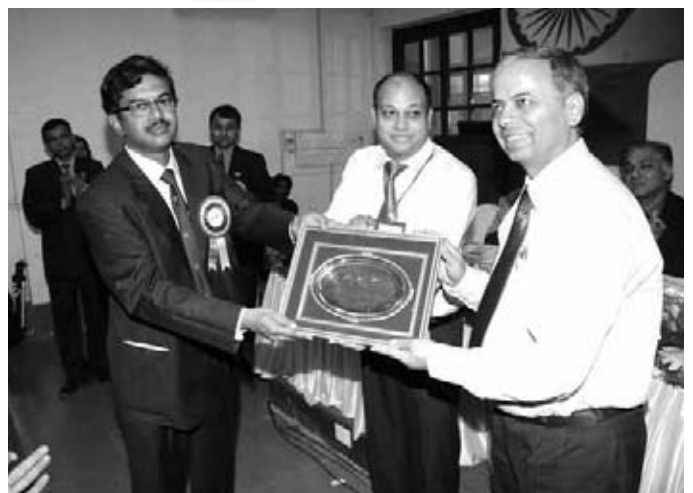
The Gujarat Team handling over the INDUS-EM Plaque to New Delhi Team