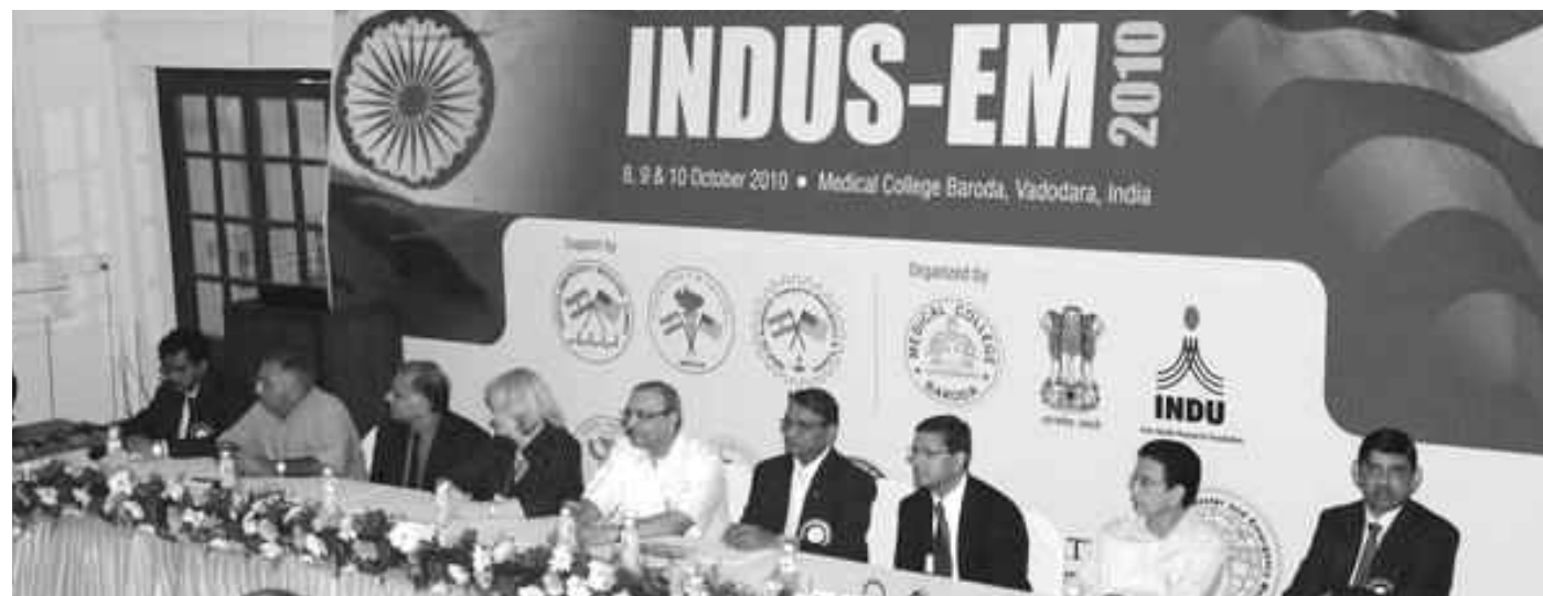
Inaugural ceremony of INDUS EM 2010

INDUS-EM 2010 was held over 5 Days and attended by 2500 Delegates. It was the First International EM Conference to be held in history of Gujarat that too in its Golden Jubilee Year. INDUS-EM 2010 was successful in exiting enthusiasm and spreading awareness in the Field of Academic EM in Gujarat and across India.