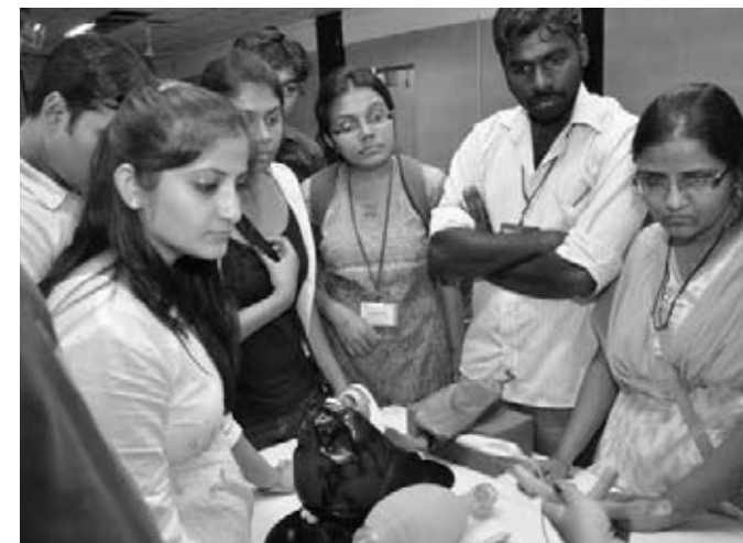
Delegates learning the Airway Skill