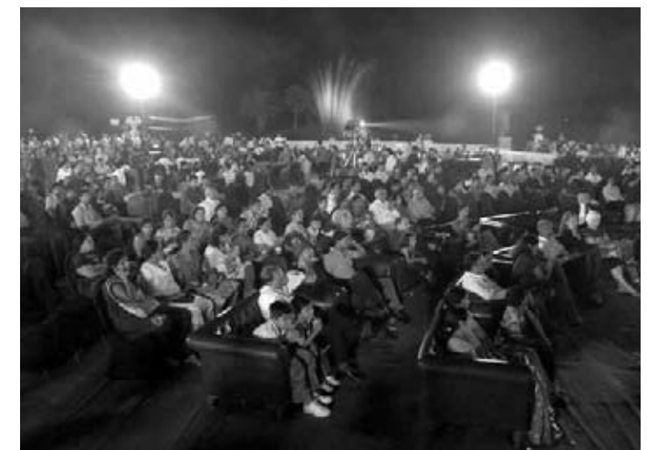
Guest Enjoying the Dhandiya