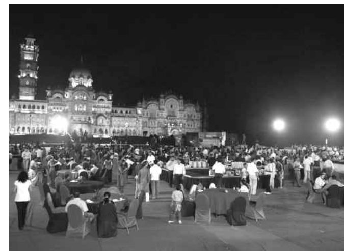
Guest Enjoying the Feast aside the Navaratra