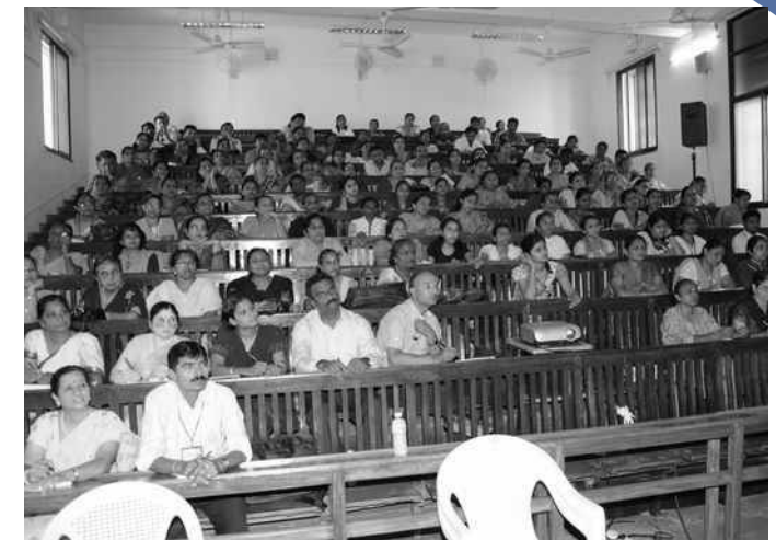
Audience in the Didactics