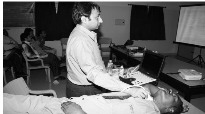
EM KAP 2013