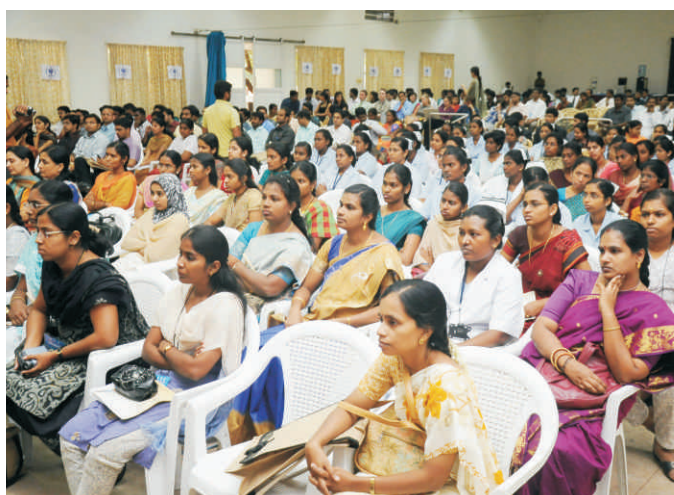
The delegates of INDUS EM 2009