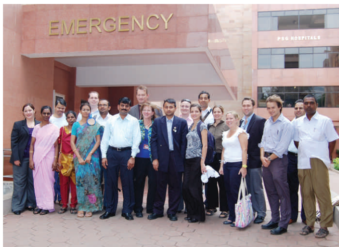
The USF Team visiting the Emergency Department, PSG Hospitals