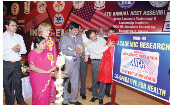
Thiru V.K. Subburaj, Health Secretary, Govt. of Tamil Nadu inaugurating the Academic Research Co-operative for Health (ARCH) at INDUS EM 2009

With India being fast recognized as a Research Hub the growth of ARC is crucial to the future of Funded Multicenter Research at Academic Medical Institutions in India.