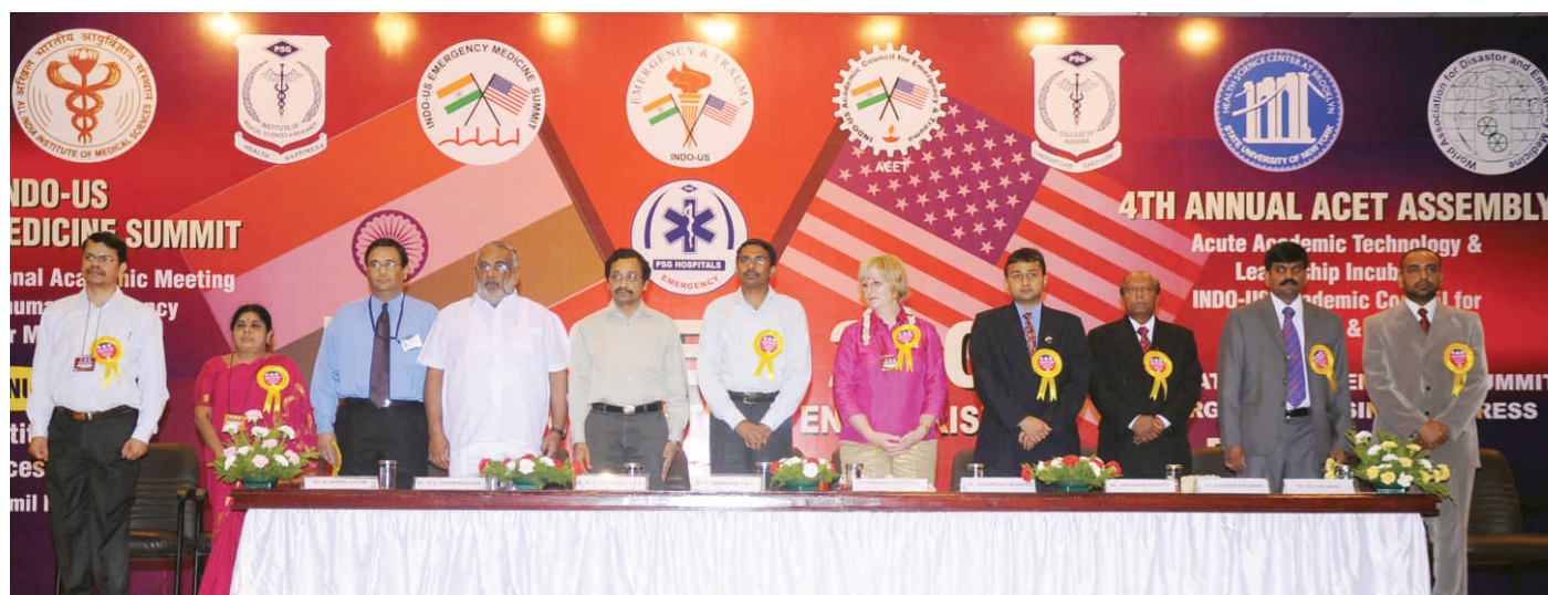
Inaugural ceremony of INDUS EM 2009

The Second Issue of the Journal of Emergencies, Trauma and Shock (JETS) for 2009 was released at the inaugural function of the Summit. JETS encourages research, education and dissemination of knowledge in the fields of Emergency Medicine, Traumatology and Shock Resuscitation thus promoting translational research by striking a synergy between basic science, clinical medicine and global health. JETS is indexed with Caspur, DOAJ, EBSCO Publishing's Electronic Databases, Expanded Academic ASAP, Genamics Journal Seek, Google Scholar, Info Trac One File, and SIIC databases, Pub Med, Pub Med Central and Ulrich's International Periodical Directory. JETS was published semiannually (June and December) in 2008, four monthly in 2009 and will be a quarterly from 2010 (January, April, July, October).