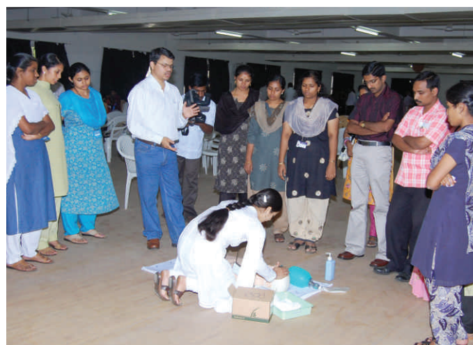
Workshop in INDUS EM 2009