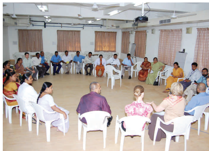
The PSG disaster preparedness training by SUNY Downstate, New York