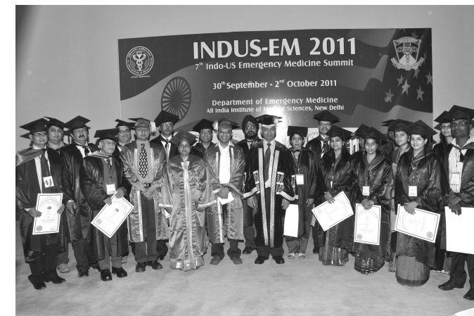
The founding fellows of ACEE-ACEN

In an effort to boost translational research in Medicine focusing on the area of Critical Illness and Injury, the first meeting of the Indian Network of Critical Illness and Injury Translational Trial Experts (INCIITTE) was held on 1 st & 2 nd October 2011 at AIIMS, New Delhi. The idea was to bring together Basic Scientists, Clinicians and Public Health Experts at one platform for the benefit of translational science. Researchers from Indian Council for Medical Research, Department of Science and Technology, Department of Biotechnology and Council for Scientific and Industrial Research will be a part of this Network. Investigators from Basic Sciences and fields of Emergency Medicine, Anesthesia, Medicine, Pediatrics & Surgery were invited to be a part of INCIITTE Network. Several research projects with novel ideas were discussed during the meeting. INDUS-EM 2011 created a new development in the field of Emergency Medicine thereby pushing in new leaders to develop the academic science holistically.