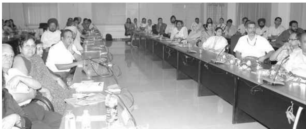
Delegates of Capital EM 2011